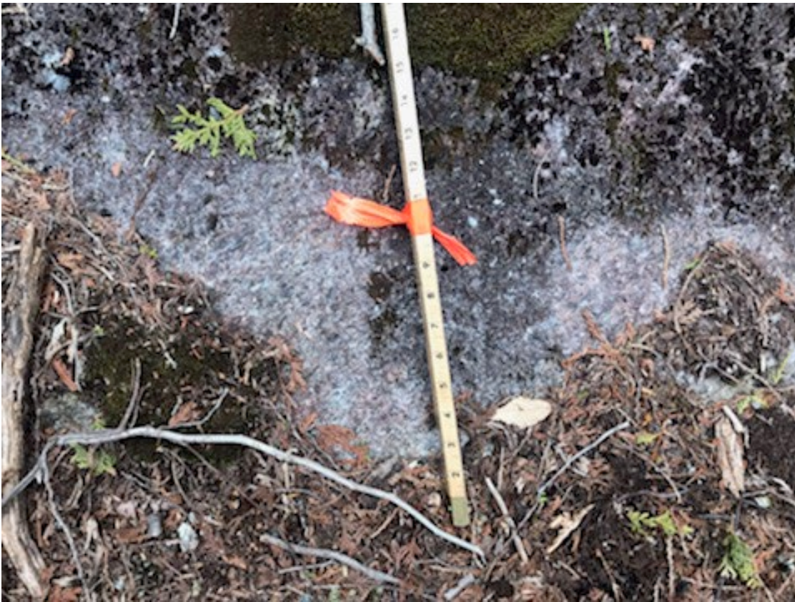
(Trail near climbing area, natural soil line marked by orange flagging. Approximately 10 inches of soil loss)