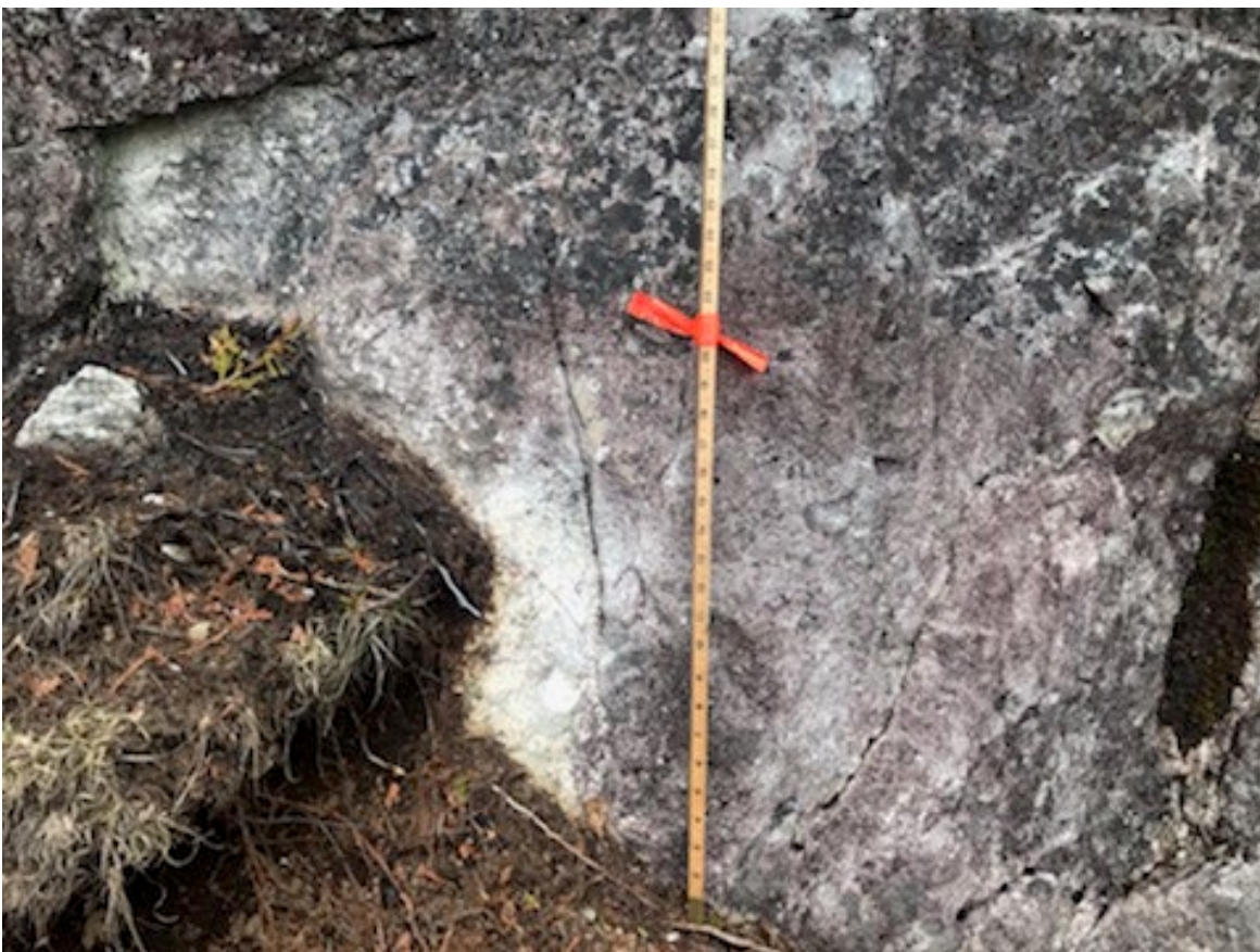
(Left side of climbing area, natural soil line marked by orange flagging. Approximately 21 inches of soil loss at this point)