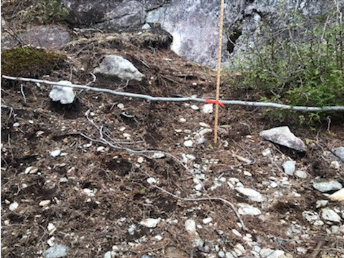
(From a distance, center of main congregation area at wall base. Twelve inches of soil loss)