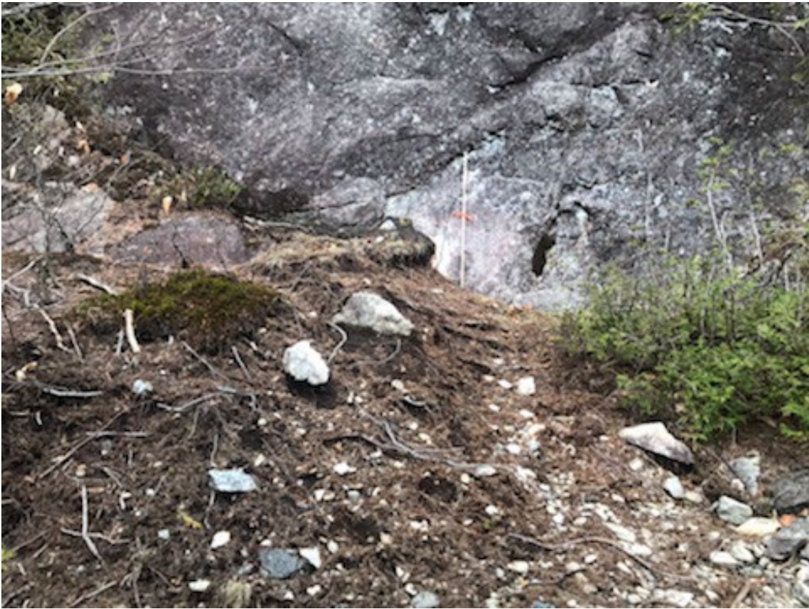
(From a distance, same 21 inches soil line as previous picture)