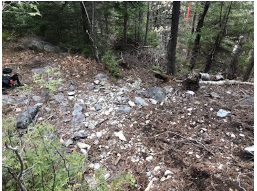
(Erosion from climbing route)