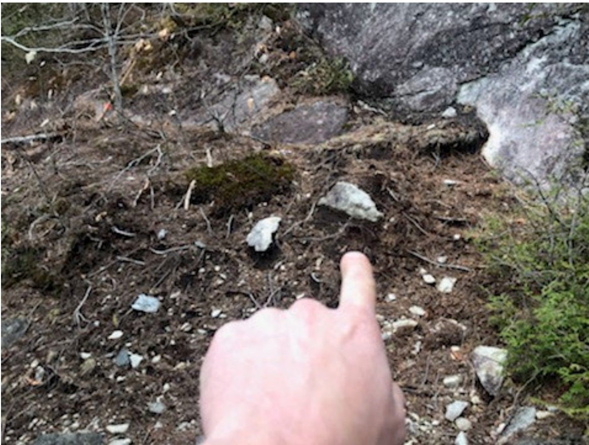
(Climbing area soil loss)