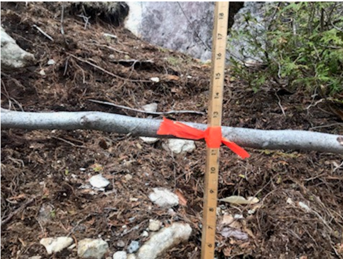
(Center of main congregation area at wall base. Twelve inches of soil loss)