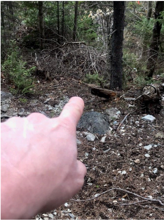
(Soil from climbing route moving downslope)