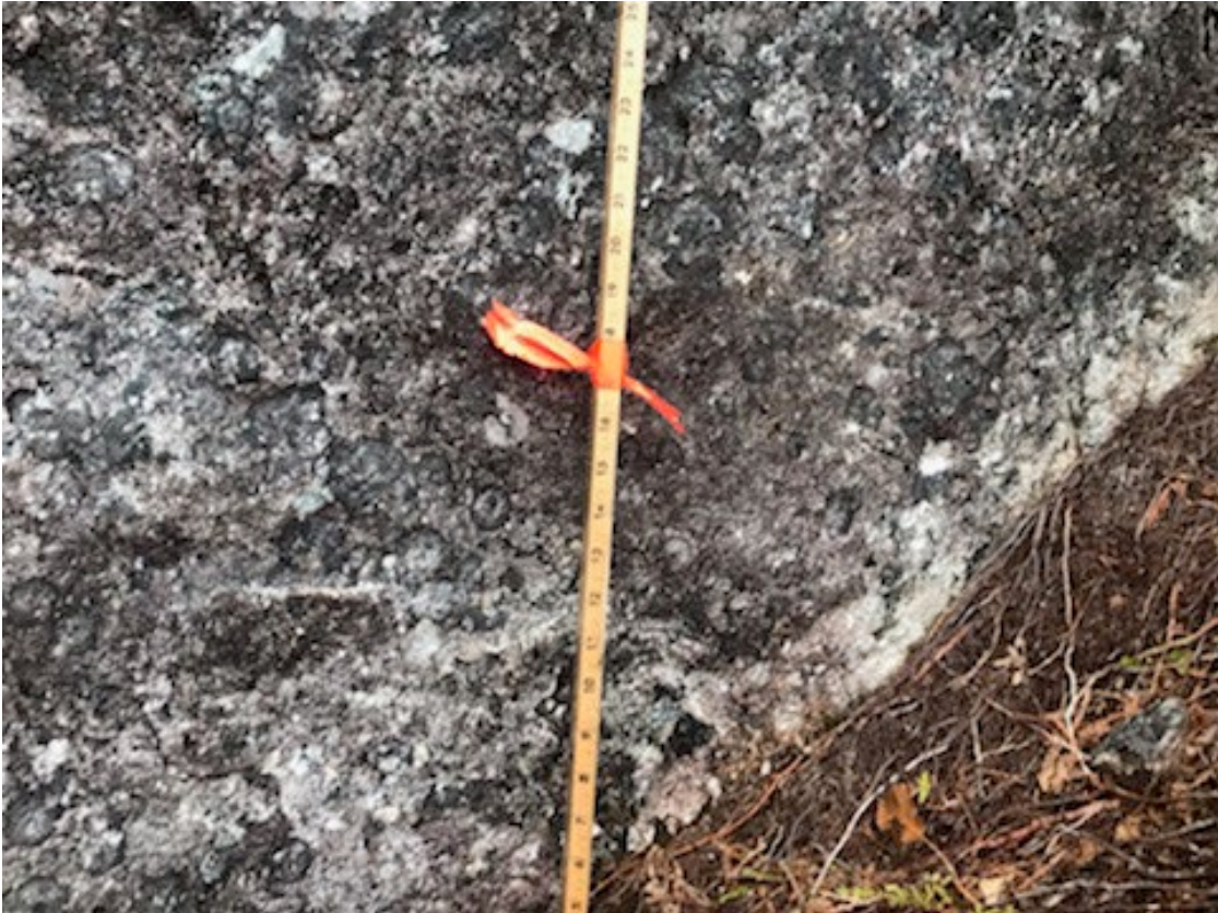
(Right side of climbing area, natural soil line marked by orange flagging. Approximately 17 inches of soil loss)