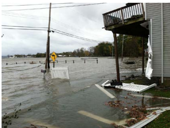
View of flooded road in Stony Point following Hurricane Sandy in 2012

State and federal agencies offer financial assistance to municipalities and non-profit organizations for activities building resilience to waterfront flooding, sea level rise and other climate risks. This document provides an overview of these assistance programs and how to apply. Eligible activities include municipal planning, improving the resiliency of structures, emergency management planning, waterfront revitalization, public outreach, and floodplain protection. A summary table of all resources, organized by agency, areas of assistance and deadlines, can be found at the end of this document.